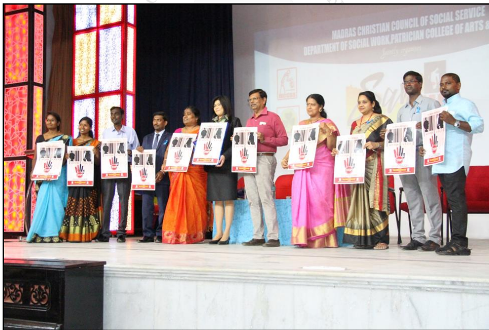
Awareness program on Anti Human Trafficking