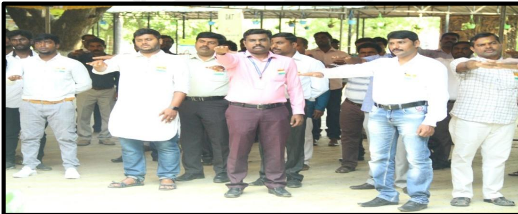
Staff and students taking the pledge on Republic Day