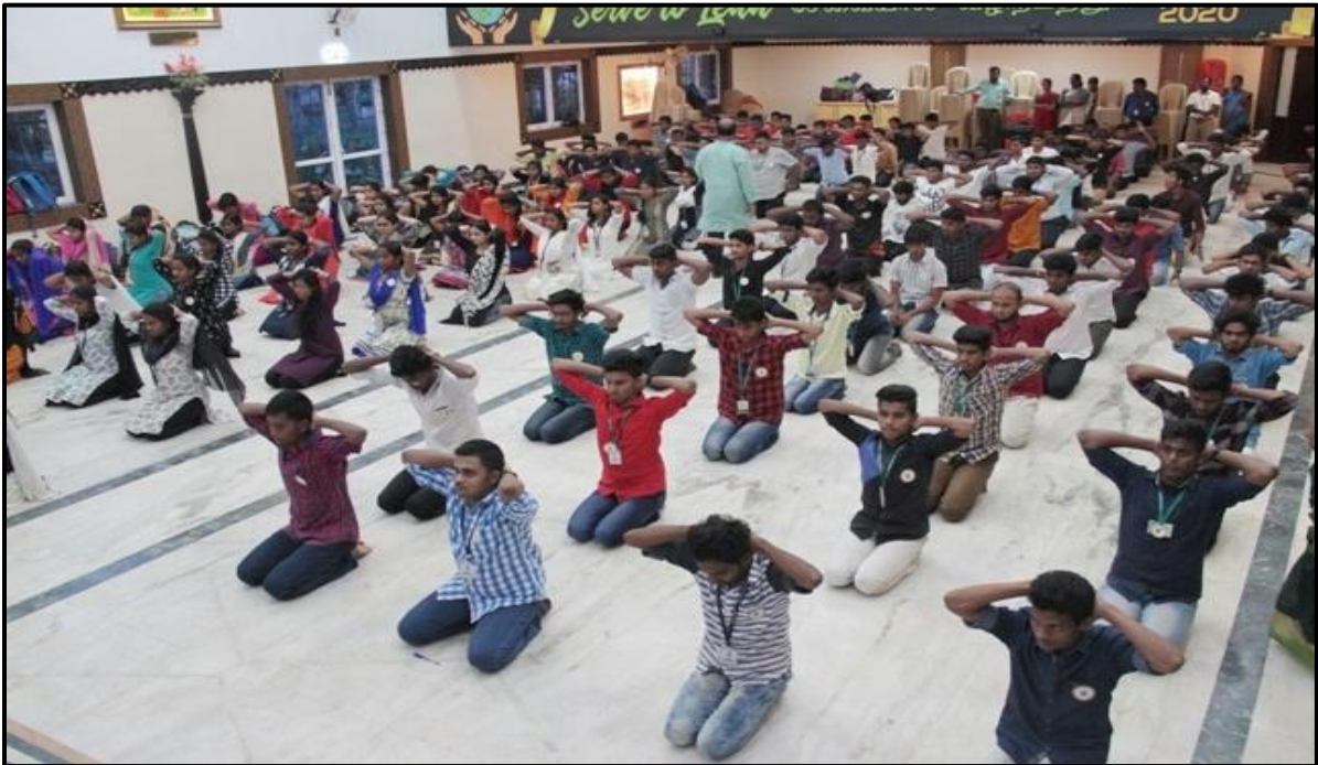
Students practicing Yoga on International Yoga Day

International Day of Yoga was observed on 21st June. To spread awareness about the importance and its effects on the health of the people. The College ensures the same on its staff and students to incorporate the meditation practice that can help to improve a person's mental well-being.