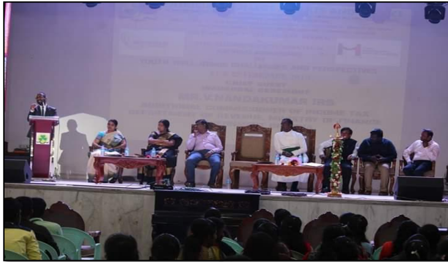
Chief Guest Mr.V. Nandakumar, Additional Commissioner of Income Tax, Department of Revenue, Govt. of India addressing the audience