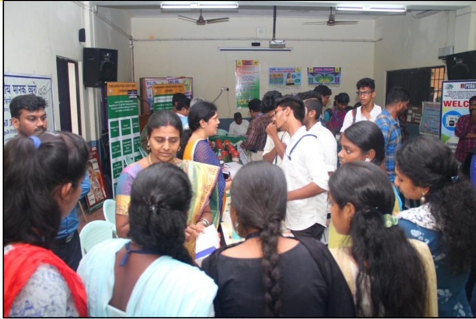
Display of various stalls by Government organisations, schools and colleges in the exhibition