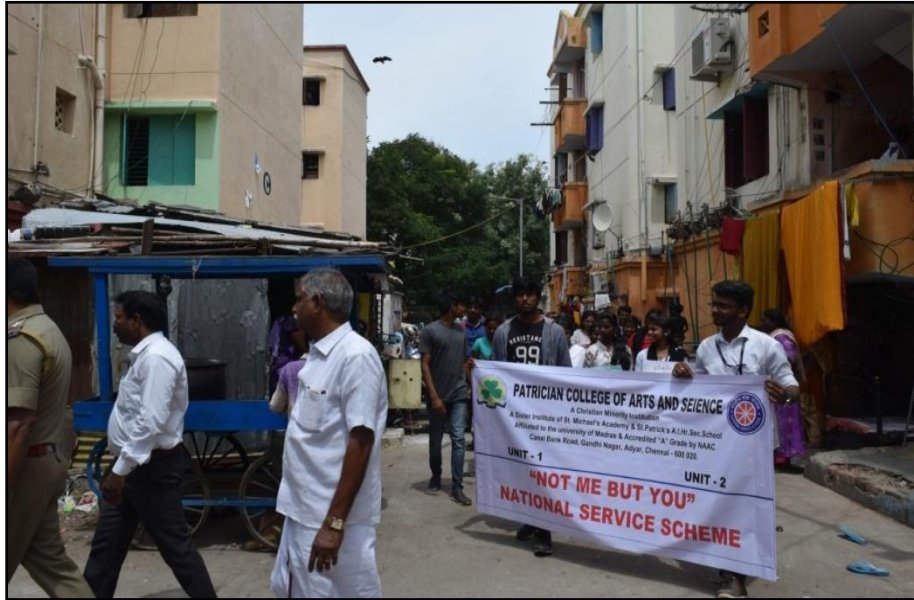
Swachh Bharath Awareness Rally at Dr. Thomas Road, Teynampet, Chennai