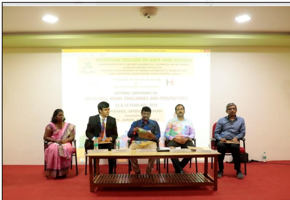
Panel Discussion on Youth Well-being: Challenges & Perspectives